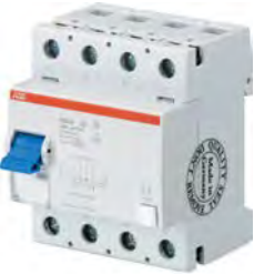
F204 125 A