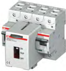
S800W-RSU (breaker is not included)