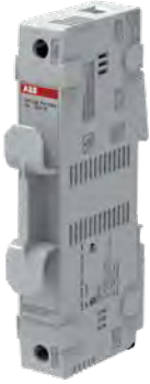
E 90 PV 1500