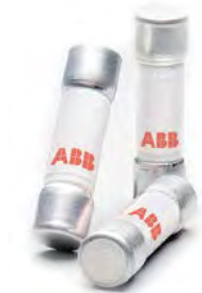
E 9F PV