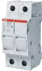
E 90 PV