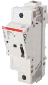
E 90 50/125