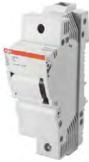
E 90 Class J