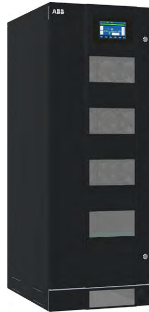
TLE Series 40-150 KVA/kW, 480 VAC