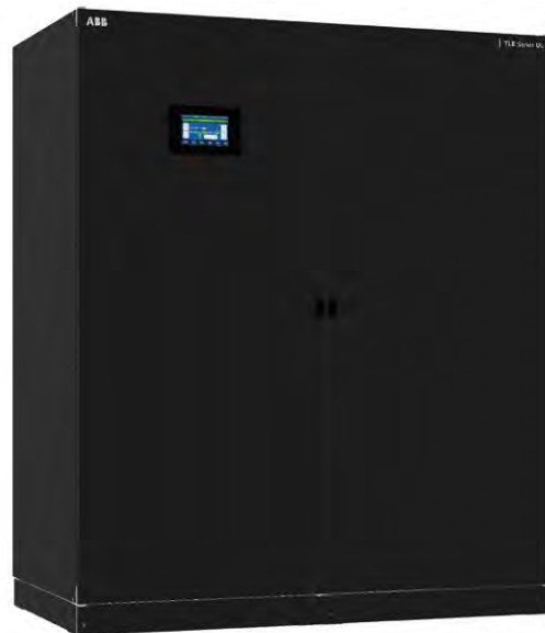
TLE Series 160-1000kW