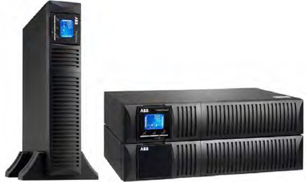
— 1 – 3 kVA + 1 EBM (tower & rack) PowerValue 11 RT G2 UL