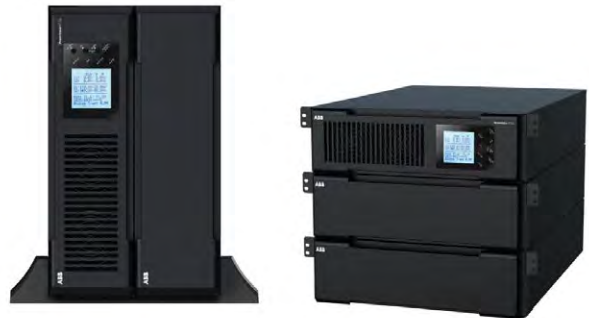
— 5–10kVA + 1 EBM (tower) 5–10kVA + 2 EBM (rack) PowerValue RT G2 UL