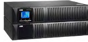
PowerValue 11 RT G2 UL UPS with 1 EBM