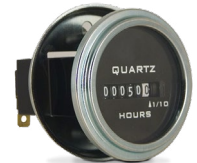
Stainless Bezel Available