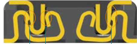
Dual Contact Point Structure