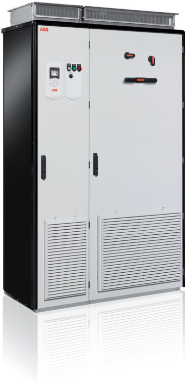
ACS880-37 cabinet-built low harmonic drive