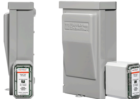
Ideal for Air Conditioning Disconnect Applications