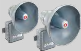
Models 304GCX and 304GCX-CN (15W), 314GCX and 314GCX-CN (15W)

SelectTone® Hazardous Location Amplified Speakers