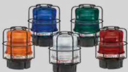
Models FB2LEDX, FB2LEDX-CN, FB2LEDX-QC, FB2LEDX-QC-S

Hazardous Location Commander® LED Rotating Light