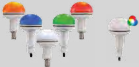
Models PM22L and PM22L RGB