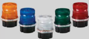
Models FB2LED and FB2LED-QC