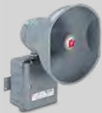
Models 300GCX and 300GCX-CN (15W), 302GCX and 302GCX-CN (30W)

Vibratone® Hazardous Location Electronic Horn