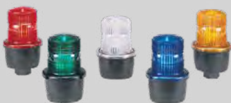
Models LP3M, LP3P and LP3S

Fireball® Supervised Hearing Impaired Strobe Lights