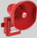
Models ASHH (15W) and ASUH (30W)