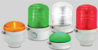
Models SLM100, SLM200, SLM300/350, SLM1400/1450 and SLMBS, SLMBD and SLMBP

StreamLine® Modular Multifunctional LED Beacons and Mounting Options