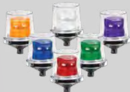
Models 225XST and 225XST-I

Electrarray® Hazardous Location LED Flashing Light