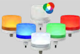
Models LP57 and LP57 RGB