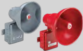
Models AM300GCX (15W) and AM302GCX (30W)

SelectTone® Hazardous Location Supervised Amplified Speakers